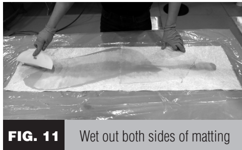
FIG. 11 Wet out both sides of matting